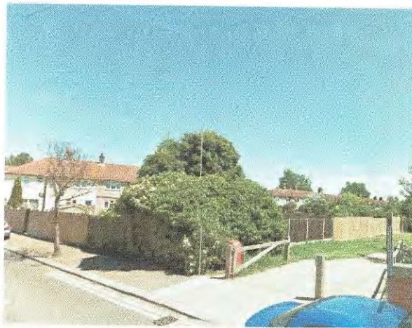
LOCATION B WITH POLE