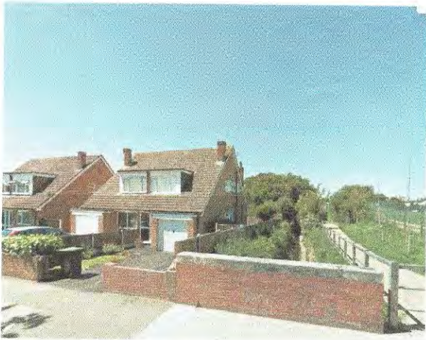
LOCATION A WITHOUT POLE