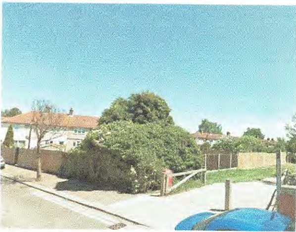
LOCATION B WITHOUT POLE