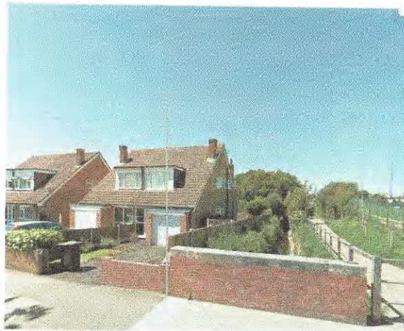
LOCATION A WITH POLE